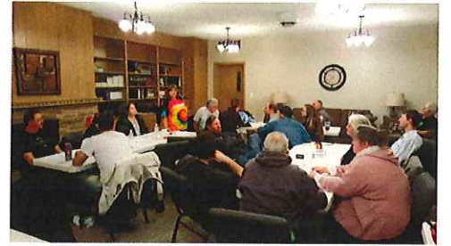
Mad House staff training and planning for another semester of ministry

WWW.MADMINISTRIES.NET..... EMAIL US AT CLMADHOUSE2000@AOL.COM