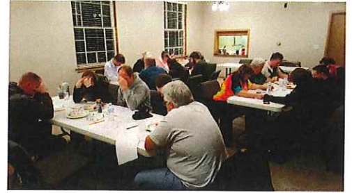
Mad House staff bathing the ministry in prayer