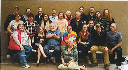
Most of the 2015-16 M.A.D. House Leaders

(Unpictured are the hundreds who pray for and financially support this ministry)