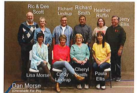
The AWESOME M.A.D. Ministries Board of Directors