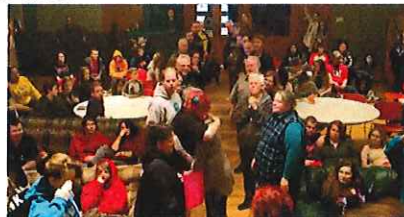
The Staff Gauntlet of Hugs for the Seniors