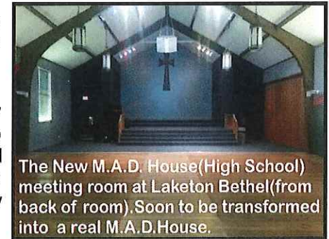
The New M.A.D. House(High School) meeting room at Laketon Bethel(from back of room). Soon to be transformed into a real M.A.D.House.

This is a new chapter in the journey and ministry of M.A.D. House. The new location that will be used for M.A.D. House(high schoolers) is very close to the old facility, so it will be easy for students to find. It's near a stop light and it's a moderate speed limit. There is a spacious parking lot and we will be given a good amount of storage space. It's a facility that the church outgrew and added on a new meeting place.