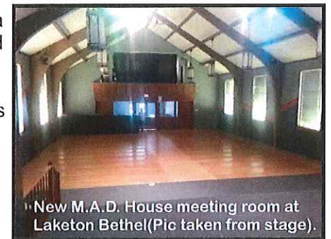
New M.A.D. House meeting room at Laketon Bethel(Pic taken from stage).

We are so grateful for these facilities that God, through His generous people, has provided. Sort of like having a "New Beginning".