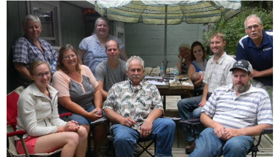
Pictured here are some of the staff for the 2015-16 season. There will be twenty five leaders in all for this year.